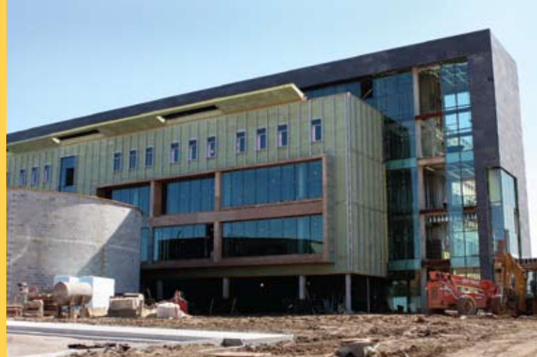
The new Education Building, on target for completion in spring 2009

The $50 million project has motivated a number of alumni to support teacher education at CMU. More than $860,000 raised last fiscal year helped lift total fundraising for the new building